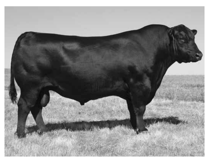
SYDGEN C C & 7

Great EPDs on this female sired by the Pathfinder bull, Plattemere Weigh Up K360. Her WW+87 is in the top 2% and her YW+146 is in the top 3% of the Angus breed. She was pasture exposed from 1/1/23 to 3/1/23 to VPI Whitlock 7E35, then pasture exposed from 3/2/23 to 6/30/23 to MAF 22B25. Vet checked safe four-five months.