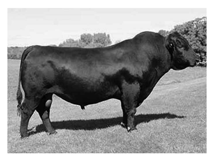
QUAKER HILL RAMPAGE 0A36