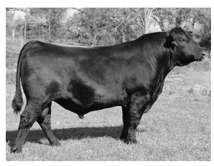
K C F BENNETT FORTRESS