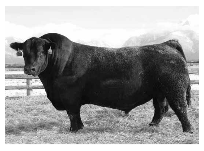
COLEMAN CHARLO 0256