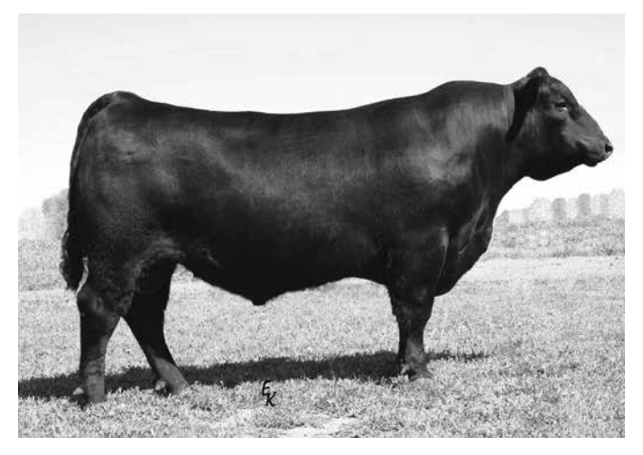
SITZ UPWARD 307R