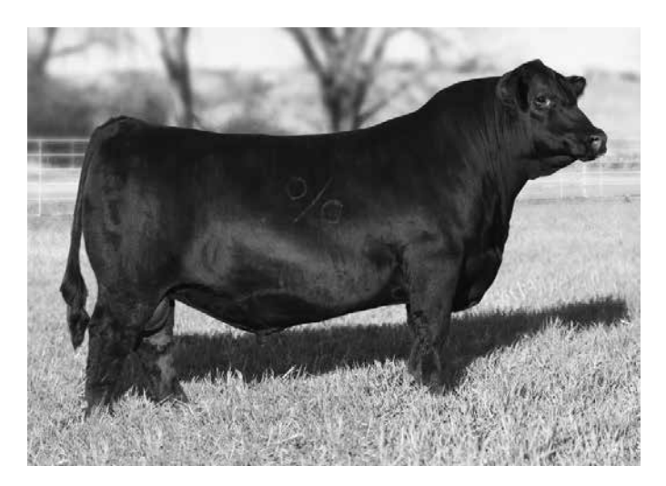
COLEMAN ENGAGE 5255