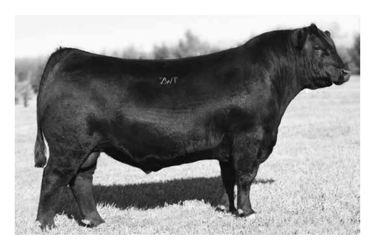
ZWT SUMMITT 6507

Another good bull calf sired by Stevenson Alternative 00081 out of a dam from the Lady cow family.