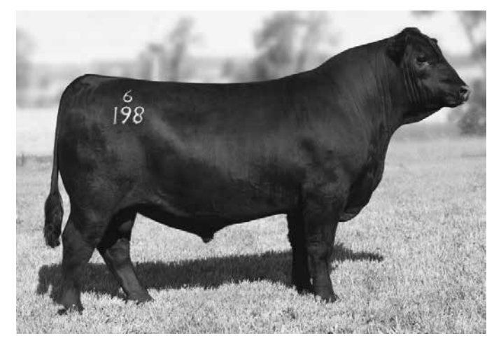
CONNEALY BLACKHAWK 6198

Outstanding EPDs on this three year old sired by the Pathfinder bull, Jindra Acclaim. Her WW+80 and YW+142 Ratios are in the top 4% of the Angus breed while her $B+192 is in the top 2%. She was pasture exposed from 1/1/23 to 3/1/23 to VPI Whitlock 7E35, then pasture exposed to MAF 22B25 whose EPDs are: +11+1.7+80+136+23 from 3/2/23 to 6/30/23. Vet checked safe five-six months.