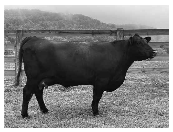
MSA SHAWNEE 9G15

This attractive weaned heifer calf, sired by V A R Revelation 6299, has an abundance of pre-weaning growth and exceptional carcass values. Her HD50K genomic profile reveals 9 different traits with a top 10% ranking. She tipped the scales with an actual weaning weight of 541 lbs. at 185 days and has a completed health record at weaning. This stylish heifer calf is certainly show-ring material, is calf-hood vaccinated, and hails from a Certified and Accredited herd.