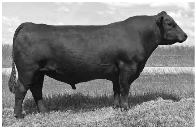
K C F BENNETT SOUTHSIDE

A nice young cow from our foundation Bonnie cow family. Sells with a 9/4/23 bull calf (BW 66 lbs), sired by Sydgen Black Pearl 2006 of the ABS stud. Sells open.