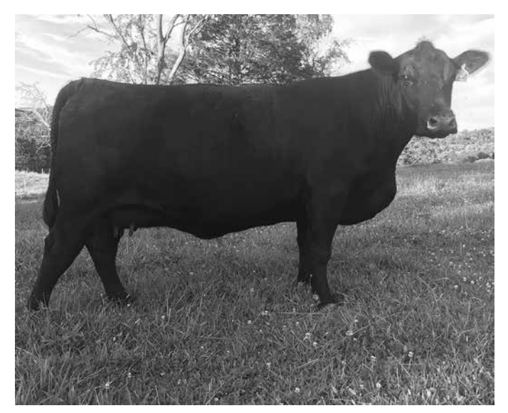
MSA BLACKBIRD 7E4