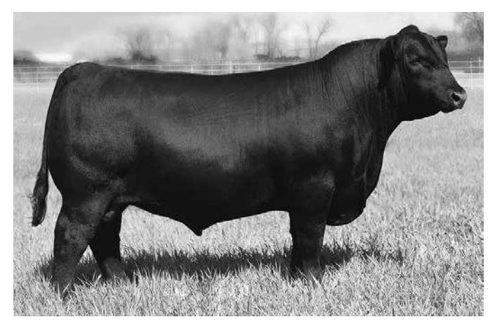
MUSGRAVE 316 STUNNER

Another nice heifer out of NMA Stunner 9070. Her WW +79 is in the Top 10% of the Angus breed. Her dam is from the Rita cow family. Sells open.