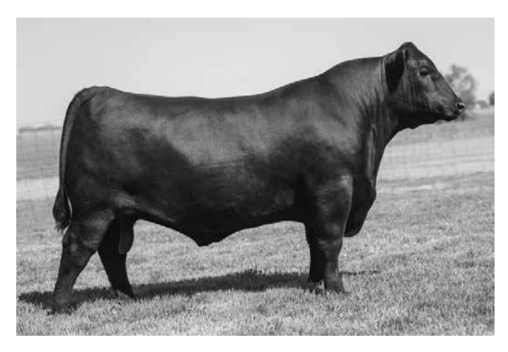
S S NIAGARA Z29

Great EPDs on this K C F Bennett Absolute granddaughter whose dam was sired by G A R Prophet. Her WW +74, $B+164 and $C+282 are in the Top 10% and her YW is in the Top 20% of the Angus breed. She was bred 2/12/23 to NMA Stunner 9070 whose EPDs are: +1 +2.8 +77 +122 +32. She was pasture exposed from 12/1/22 until 3/1/23 to NMA Rainmaker 9084 (#19802624) and NMA Stunner I810 (#20223125). Breeding update sale day.