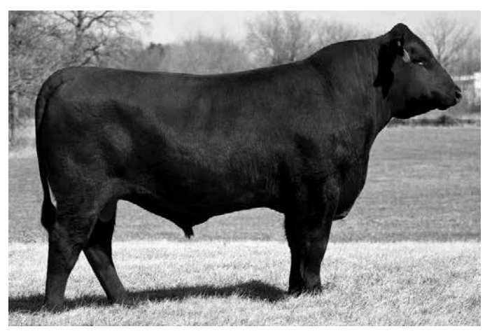
E WAPEYTON 642