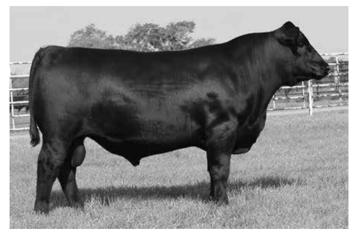
DEER VALLEY ALL IN

This Deer Valley Unique 5635 daughter is out of a pathfinder Cow from the Clova cow family. The reason I have so many Clova cows to sell is they make good cows that work. She is bred to GHS Full Tank 110 for a March calf.