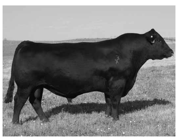
EXAR UPSHOT 0562B

An open heifer from Taylor Angus Farm. A granddaughter of MGR Treasure out of a Lucas Lady dam from the Lucas Angus herd in Blacksburg, VA. Nice EPDs on this young female.