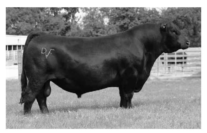
DEER VALLEY GROWTH FUND