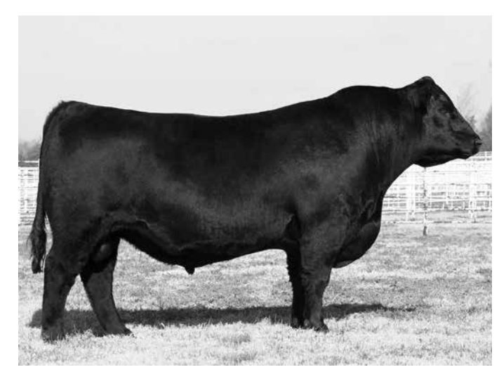
PLATTEMERE WEIGH UP K360

Outstanding EPDs on this female sired by Jindra Acclaim. Her YW+145 Ratio and $B+186 are in the top 3% of the Angus breed. She was pasture exposed from 1/1/23 to 3/1/23 to VPI Whitlock 7E35, then pasture exposed from 3/2/23 to 6/30/23 to MAF 22B25 whose EPDs are: +11+1.7+80+136+23. Vet checked safe five-six months.