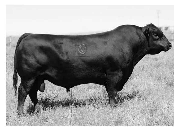
BASIN PAYWEIGHT 107S

Olge MS Patriarch 622 sired by bullet proof maternal sire, Tehama Patriarch F028. Her dam is a stand out K C F Bennett Fortress daughter. This heifer looks like her dam; thick made, deep sided, large spring of rib. Should have a bright future. Sells open.