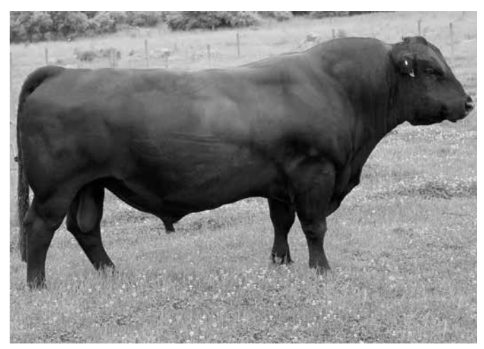
WERNER WAR PARTY 2417