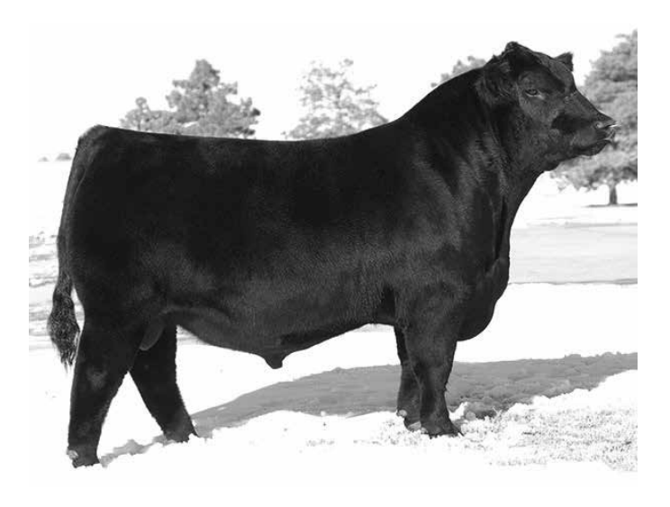
DAMERON FIRST CLASS

This S S Niagara Z29 daughter is from another branch of the Clova family in our herd. They are functional hard working cows that raise big calves and breed back every year. She is bred for a January calf to MF Complement N Stan 1756, who has left good daughters of his own in our herd.