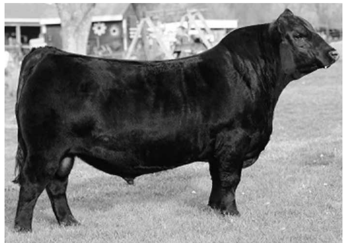
R B TOUR OF DUTY 177

A daughter of R B Tour of Duty who shows several Pathfinder bulls in her pedigree. Sells with a bull calf born 2/10/23 sired by BJ Surpass whose EPDs are +14 -1.1 +71 +120 +35 $B+162 $C+325 (Top 2% of the Angus breed).