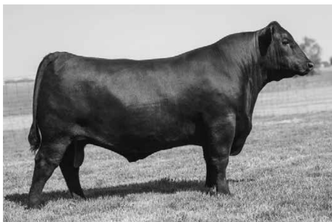
S S NIAGARA Z29