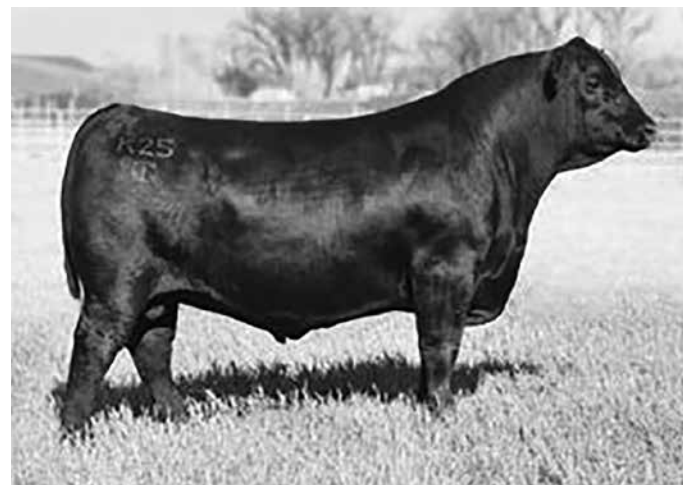
G A R ASHLAND