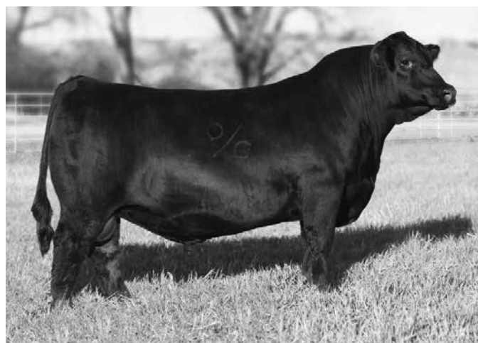
COLEMAN ENGAGE 5255