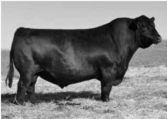
BASIN PAYWEIGHT 1682