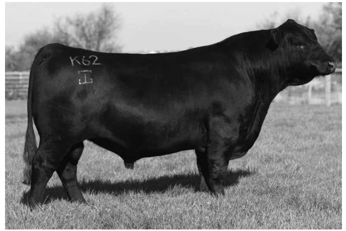
G A R SURE FIRE