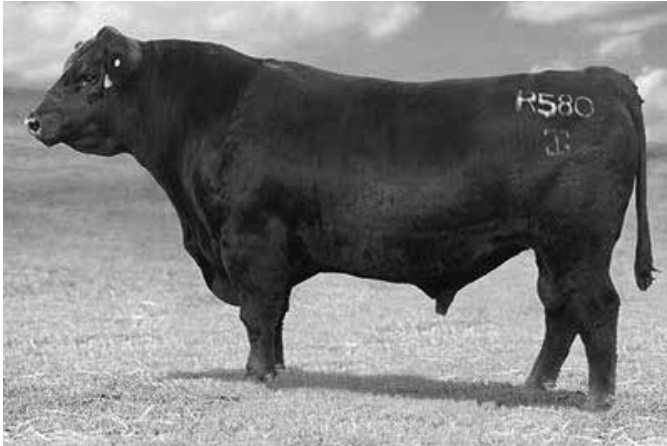
G A R DAYLIGHT