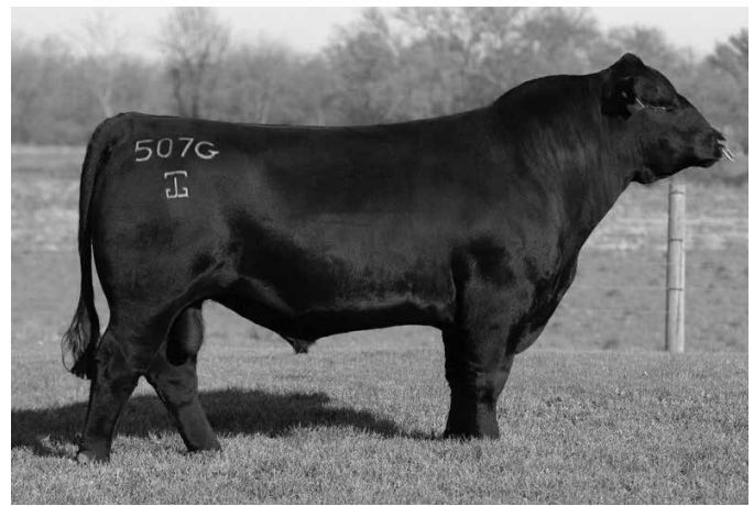
G A R DUAL THREAT