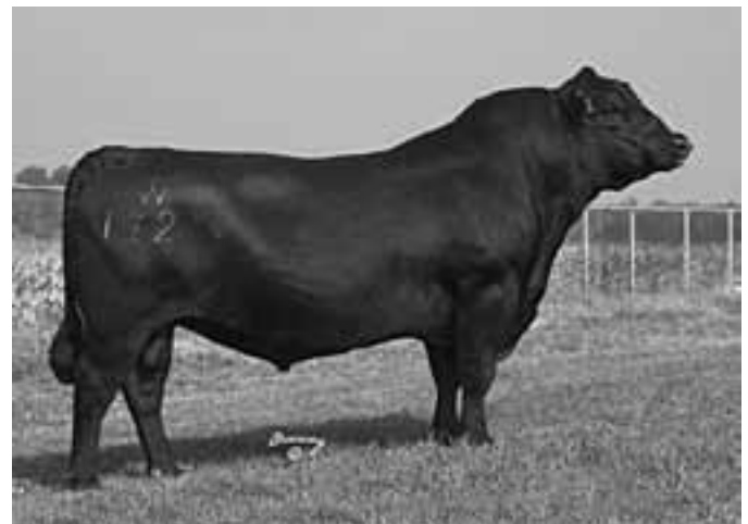
RITO 1I2 OF 2536 RITO 6I6

Consignor: PHILLIPS MOUNTAIN ANGUS BUD PHILLIPS