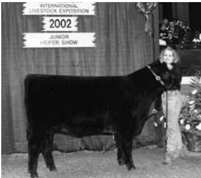
WEST WIND PRIMROSE WWTN11

This is a stylish heifer stemming back to Gambles Miss LBFB and the great Primrose family. The females out of this line have proven to be tremendous producers and easy going females.