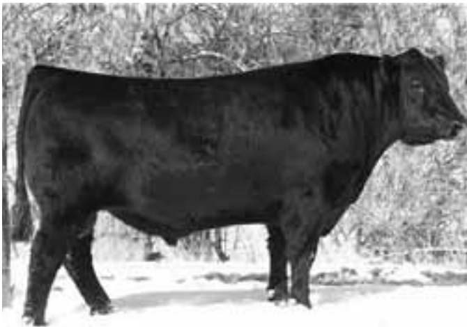
SITZ DASH 10277