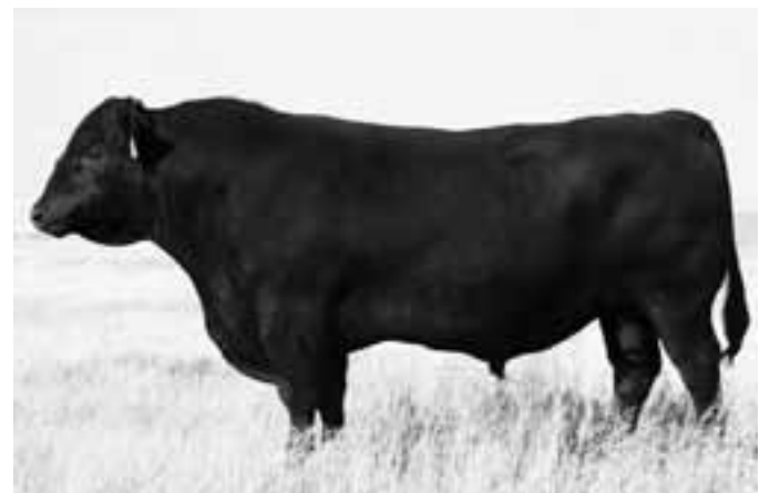
SITZ IDENTITY 2575