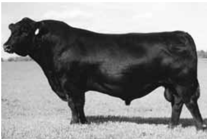
Boyd New Day 8005

The first of three nice young females from the BF New Day 962 herd sire used at Bullock Farms. Back to some older blood on the bottom side. Just a solid young functional heifer with potential to make a top cow.