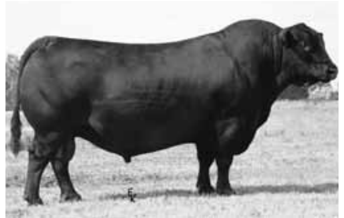
S A V FINAL ANSWER 0035