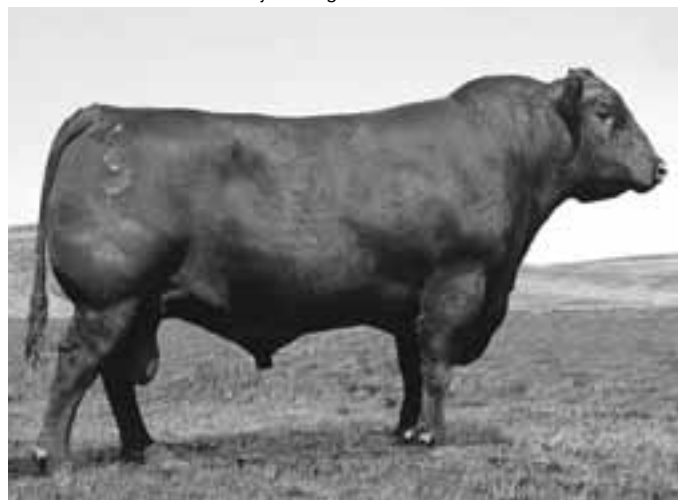
SITZ ALLIANCE 6595

A daughter of the T361 bull from the Petunia cow family. These open heifers meet the requirements of Virginia Premium Assured Heifer Program. They were vaccinated with modified live and calthood vaccinated in the fall. They were worked again and dewormed this spring. They are repro-tracted scored, pelvic measured, and PI free. A shot of Lutalyse on 4/30/13 will complete their breeding protocol. You can then either heat detect and AI, use timed AI or turn with the bull. They averaged 850 on 3/20/13.