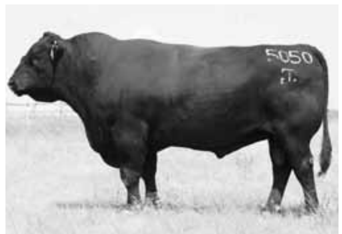
G A R New Design 5050