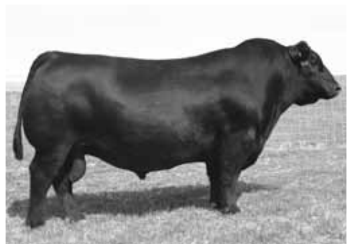
SAV NET WORTH 4200

Consignor: PHILLIPS MOUNTAIN ANGUS BUD PHILLIPS